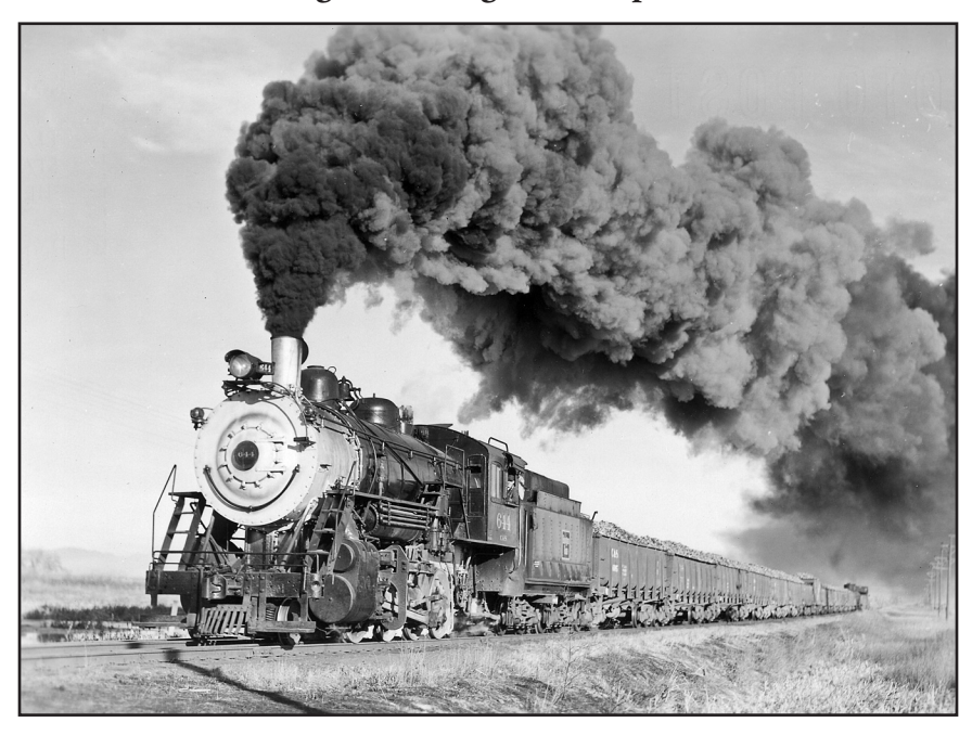
C&S 644 leads a southbound extra with beets for the Loveland factory from Fort Collins on December 8, 1957.

and taking them to factories at Ovid, Sterling, Eaton, Greeley and Brighton. Since the UP had several branch lines in this area, as well as the Dent Subdivision, the operations fanned out in various directions. Small locomotives (2-8-0) were primarily used, although heavier (2-8-2) locomotives were placed on specified runs where heavier tonnage existed. A 4-8-4 was used regularly on the La Salle to Sterling run in 1956!