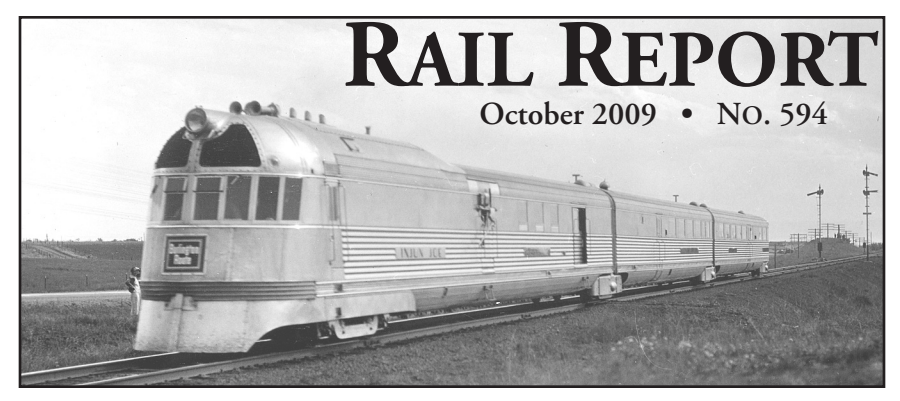
Rocky Mountain Railroad Club • Rocky Mountain Railroad Historical Foundation