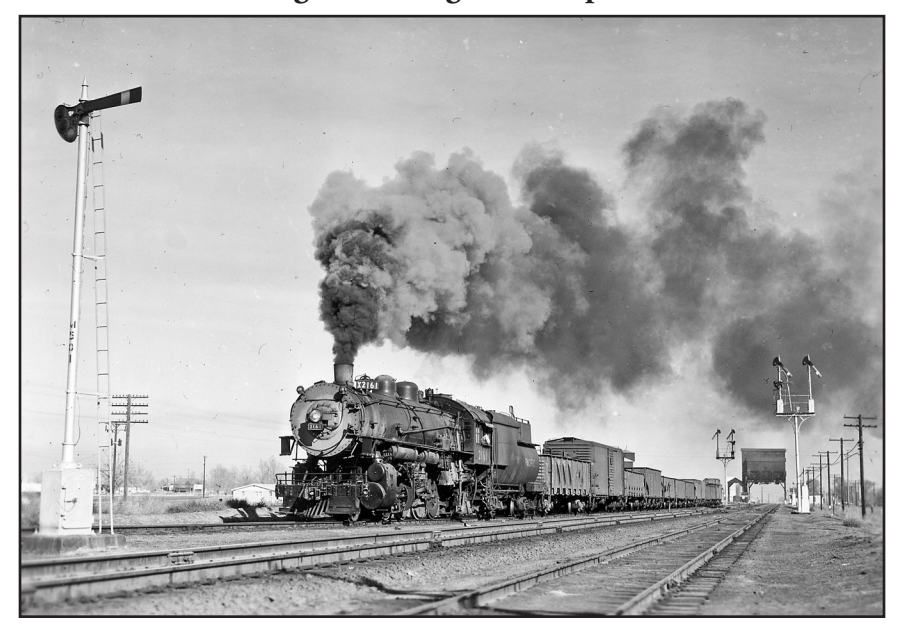
UP 2161 leaving La Salle, Colorado, eastbound on the Dent Branch on December 1, 1956, with hopper and gondola cars for beet loading.

of Denver (locals headquartered at La Salle). Each of these roads added several assignments during this season to meet the shipper's needs for this commodity.