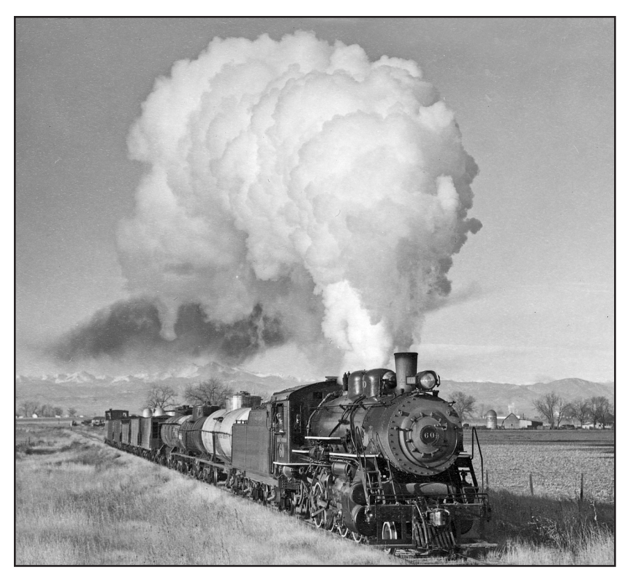
Engine 60 was built in 1937 for the Great Western. Molasses produced from sugar beets in the Windsor factory was loaded into tank cars and the hoppers were for the sugar beets.