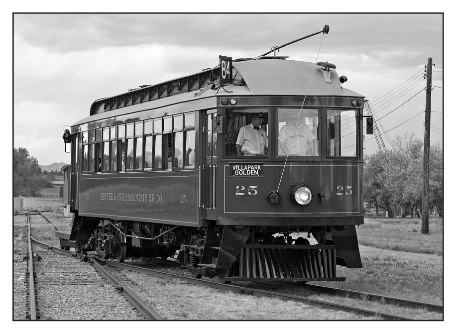
Denver & Intermountain interurban No. 25 "out on the line" at the Denver Federal Center on August 15, 2009.